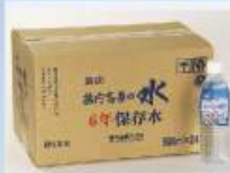
Natural Mineral Water Shelf Life: 6 years