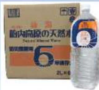
Natural Mineral Water Shelf Life: 6 years